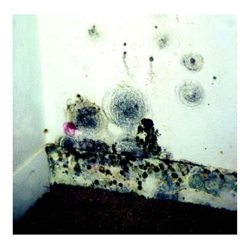
Photo 3A: Mold growing in closet as a result of condensation from room air