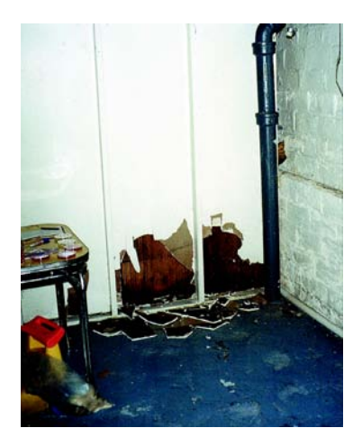
Photo 3B: Front side of wallboard looks fine, but the back side is covered with mold