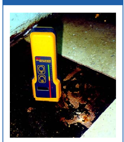
Photo 9: Moisture meter measuring moisture content of plywood subfloor