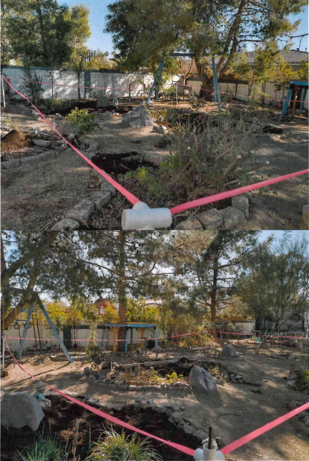
Elevation of the leach field area.